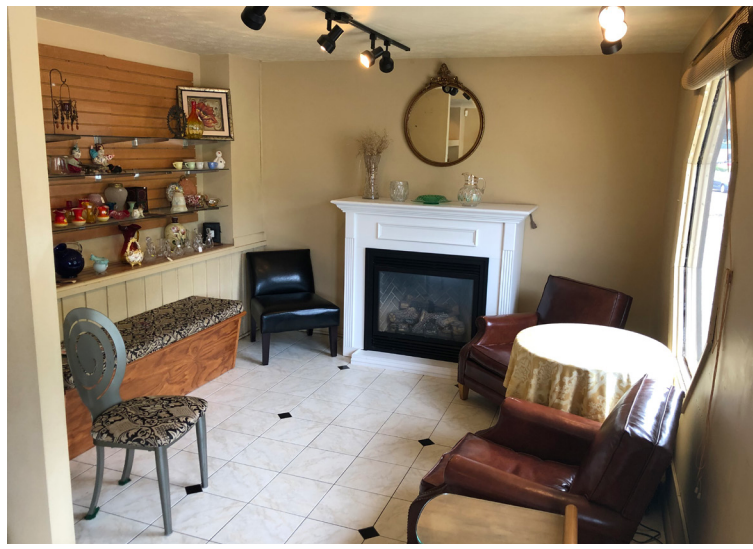
PREVIEW: WEDNESDAY - SEPTEMBER 23, 2020 4:30-5:30 PM

PICKUP: WEDNESDAY - SEPTEMBER 30, 2020 4:00-6:00 PM